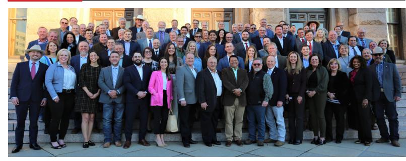
Nearly 150 members visited almost 181 legislative offices about industry priorities during the AGC of Texas Capital Day in February.

Members of the Legislative Drafting & Review Committee and AGC of Texas Staff reviewed the more than 8,000 bills that were filed during the 88th Legislative Session to determine what effect, if any, the legislation would have on the heavy highway industry. Below is an overview of the major legislation that was passed during the session: